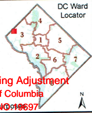
EXHIBIT NO. 8

Board of Zoning Adjustment District of Columbia Print Date: 06/16/2019 For general public use only